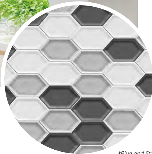
*Blue and Steel colours shown close-up