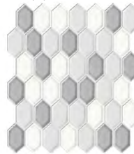
1.5x3 Elongated Hex Mosaic — Mesh Mounted 11x13 Sheet